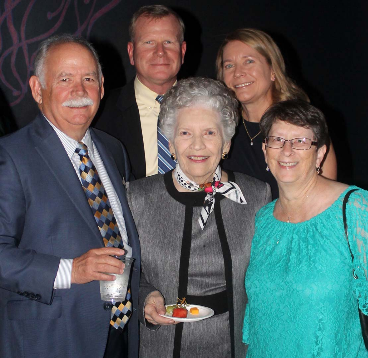
Dinner at the Aquarium