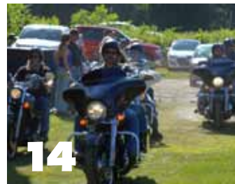
Wack's Ride / New staff