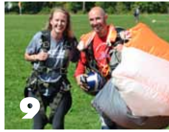
Wish Jump 2017