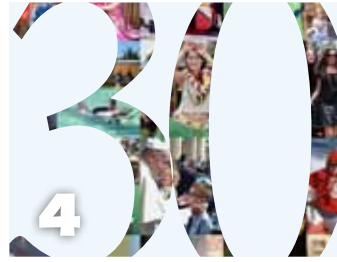
Our 30 year history