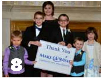
Gala 2018 preview