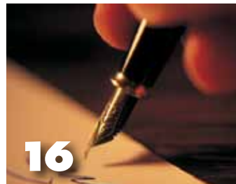
Gift giving / Matching gifts