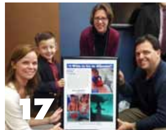
Donor profile: GTM Payroll Services