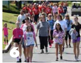
Walk for Wishes